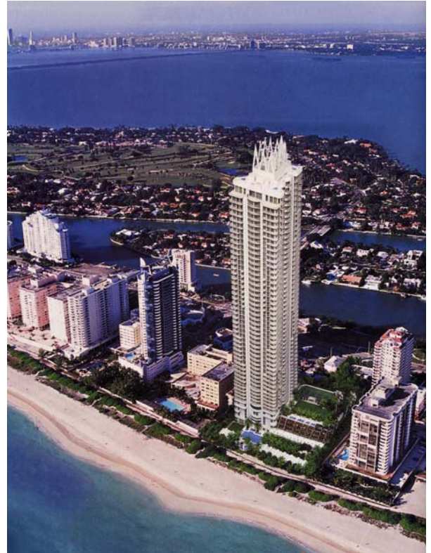
Akoya, Miami Beach

BCArchitects AIA, Inc., located in Coral Gables, has created some of South Florida's most distinctive architectural designs, and is annually responsible for providing services for projects with construction values in excess of 300 million dollars.