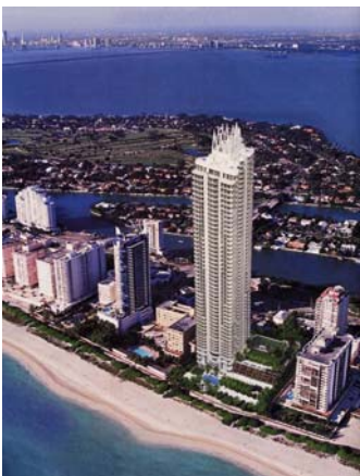
One City Plaza, West Palm Beach

BCArchitects AIA, Inc., located in Coral Gables, has created some of South Florida's most distinctive architectural designs, and is annually responsible for providing services for projects with construction values in excess of 300 million dollars.